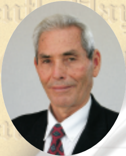
Caetano Verto Sink Brazil