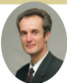
Ionita Raducu Young People Department