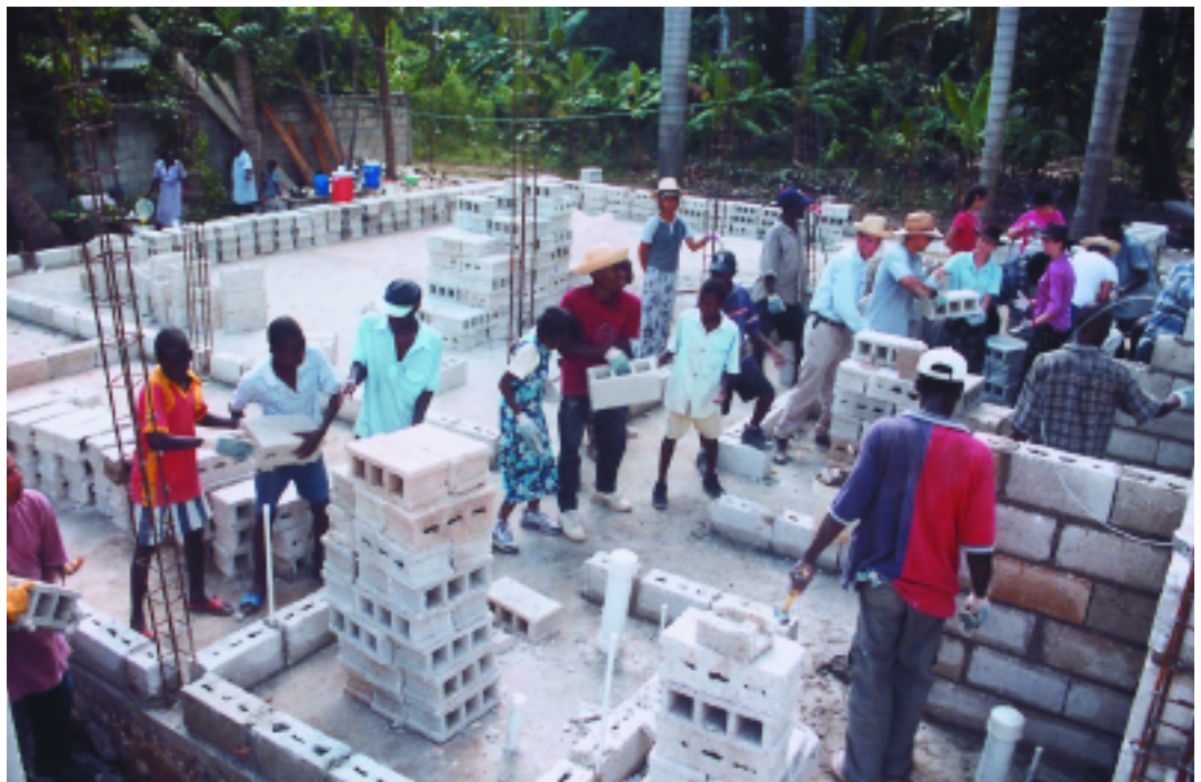
The Youth Building Program at work in 2002—constructing a chapel in Haiti.