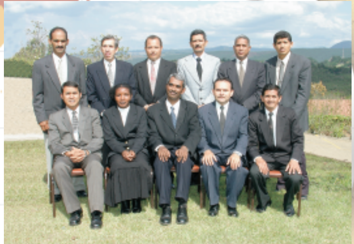
Central American Region