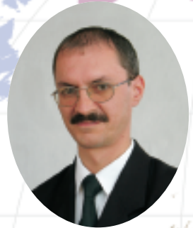
Ferenc Nagy Hungary