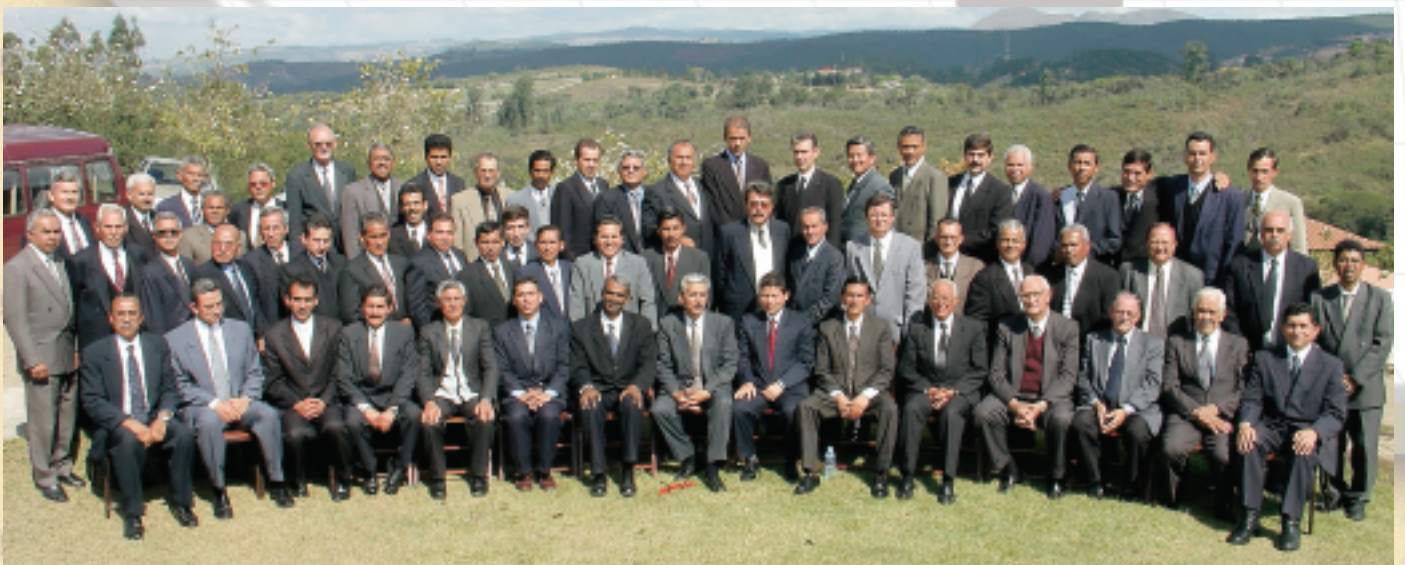
South American Region