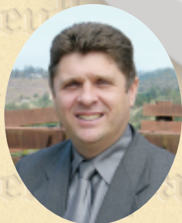
Petro Stratan Ukraine