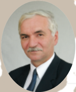
Piste Florin Romania