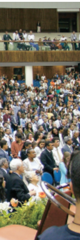
Left. The vast congregation assembled from around the world delighted in feasting on the spiritual food.