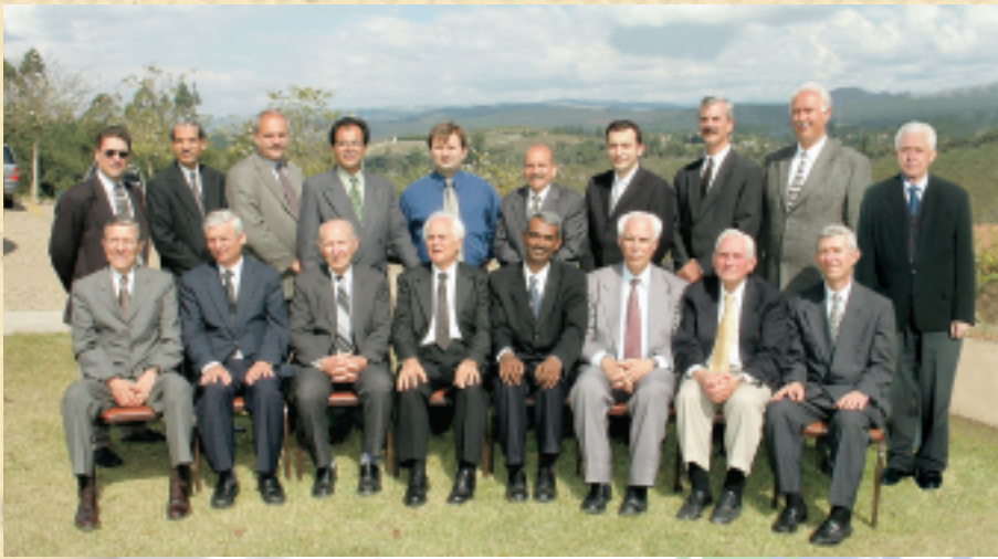
North American Region