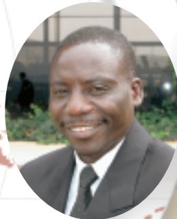
Isaac Daka Zambia