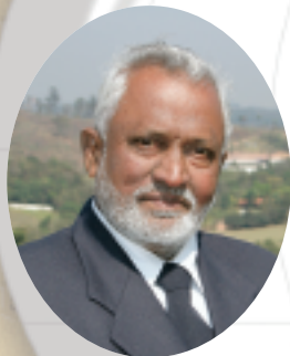
Soundrapandian Pitchmuthu India